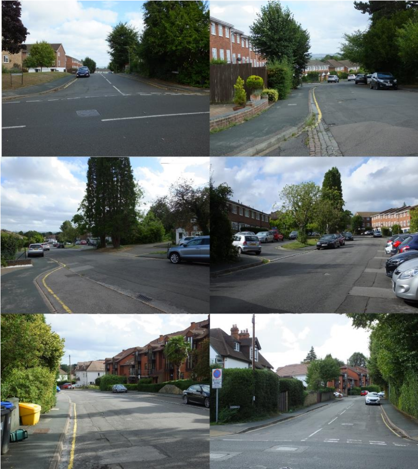
Midhope Road now