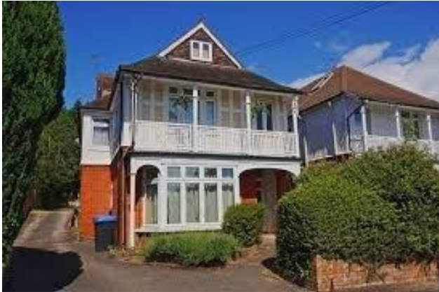
House typical of the period