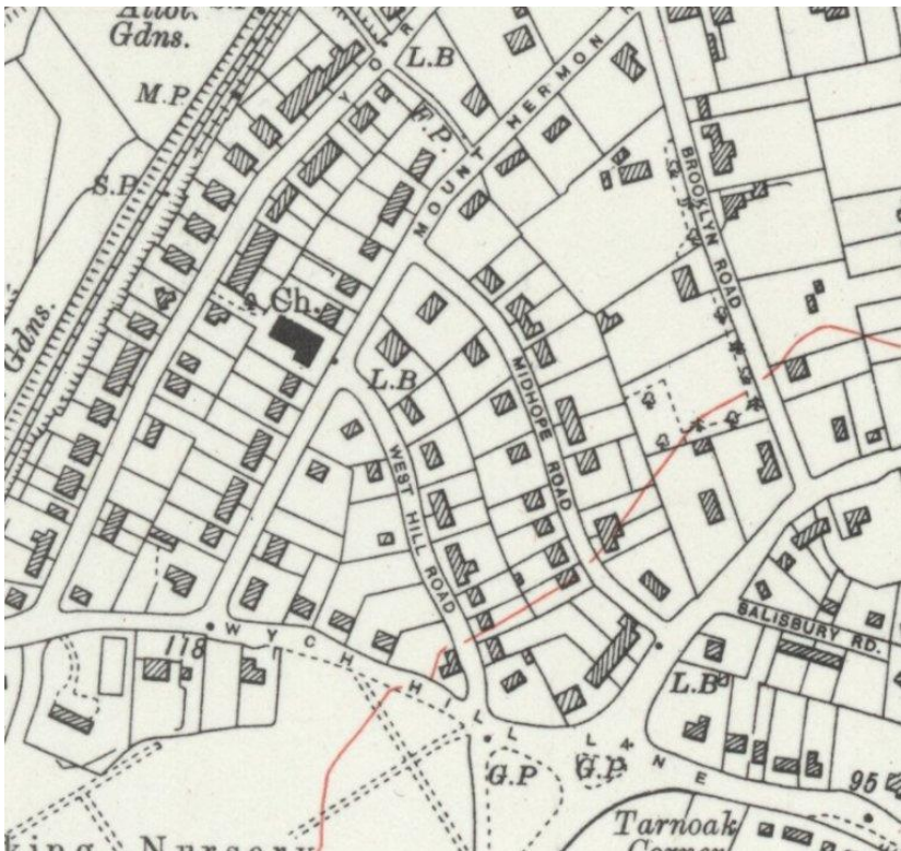
OS map 1937 – 6 inch to mile Surrey XV1.SE